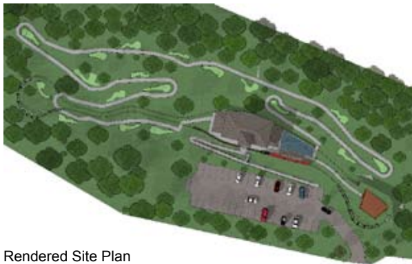
Rendered Site Plan