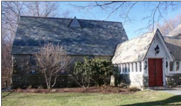
Front Elevation - After