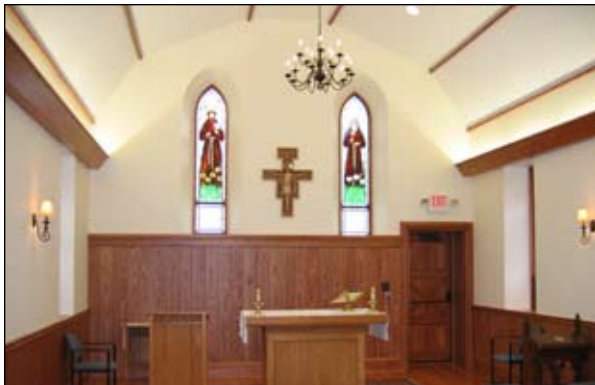
Sanctuary Space - After