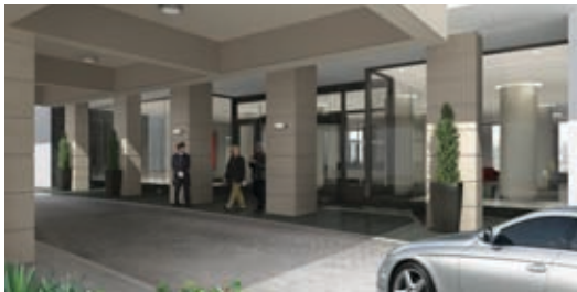
Porte Cochere/ Entry