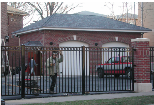
New brick piers, fencing, and maintenance building.