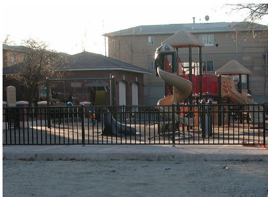
View of playground with maintenance building behind.