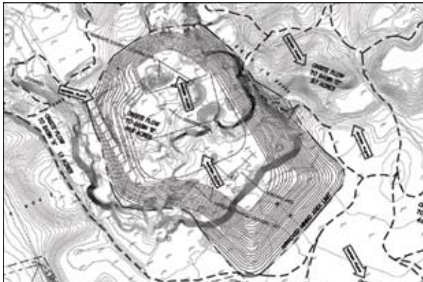
Site Plan (Enlarged)