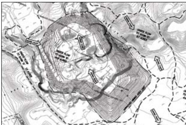
Site Plan (Enlarged)