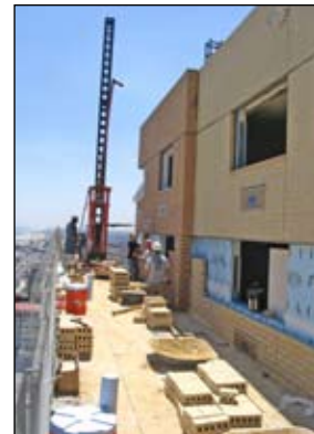
Scaffold - Work Area