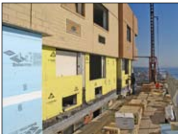
Wall Panel Installation