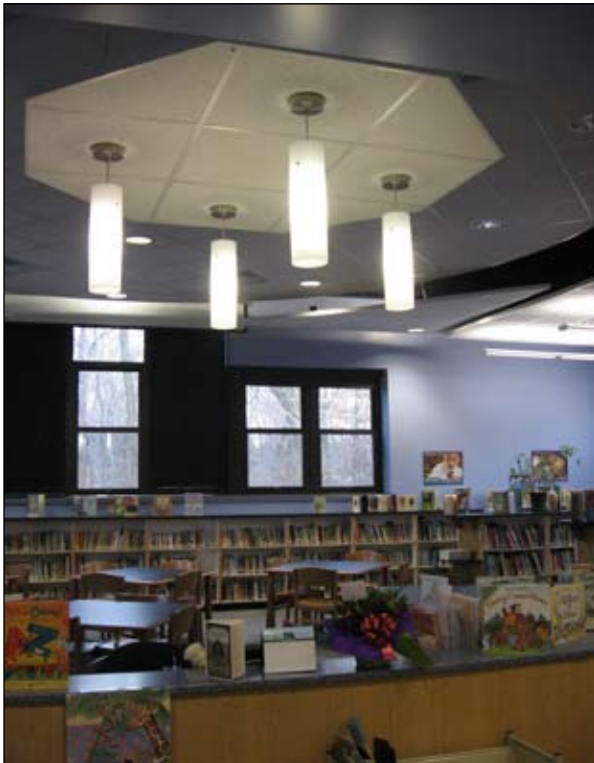
Media Center Lighting/Ceiling Details