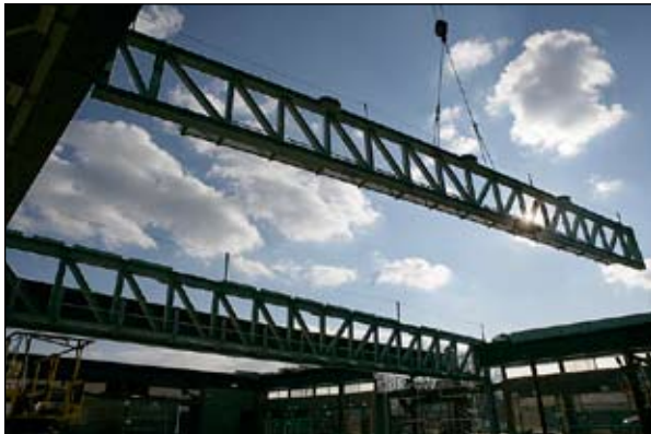
Structural Bracing - Under Construction