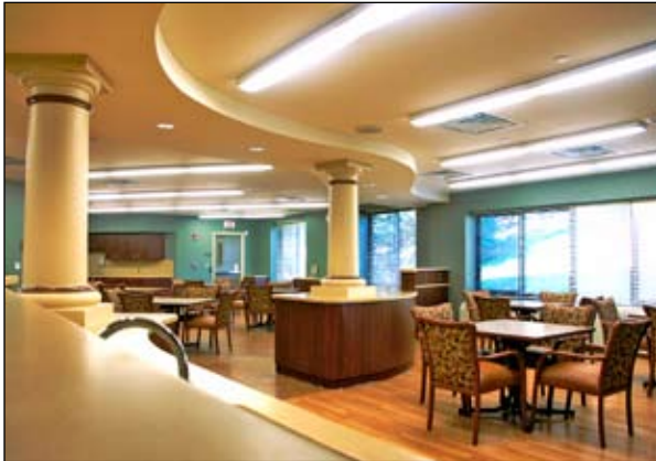
Activity Room & Dining Area