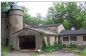
North Elevation - Before