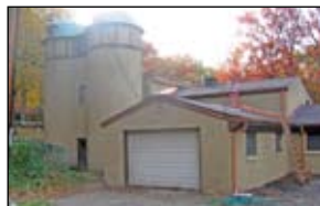
North Elevation - After