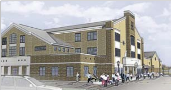
Rendering of John Y. Dater School - Front Perspective