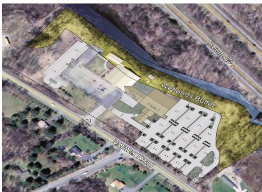
An aerial site plan depicting proposed development.