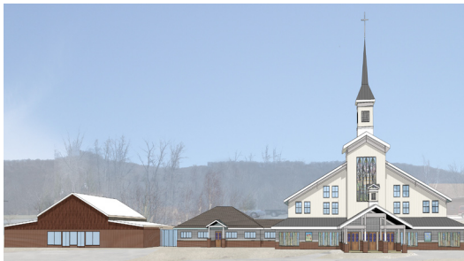
A conceptual rendering of the front elevation of the proposed Mission Church.