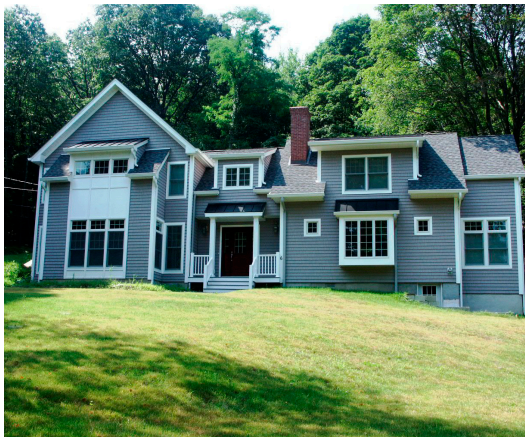
View of the renovated finished exterior.