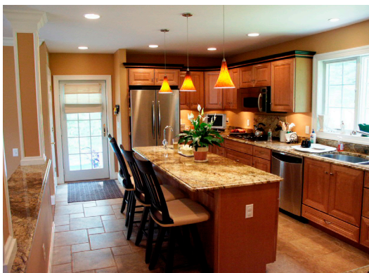
View of the new kitchen interior.